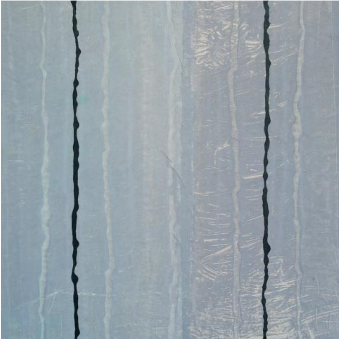
Uten tittel | Untitled ▶ Acryl og olje på lerret | Acrylic and oil on canvas 160 x 160 cm