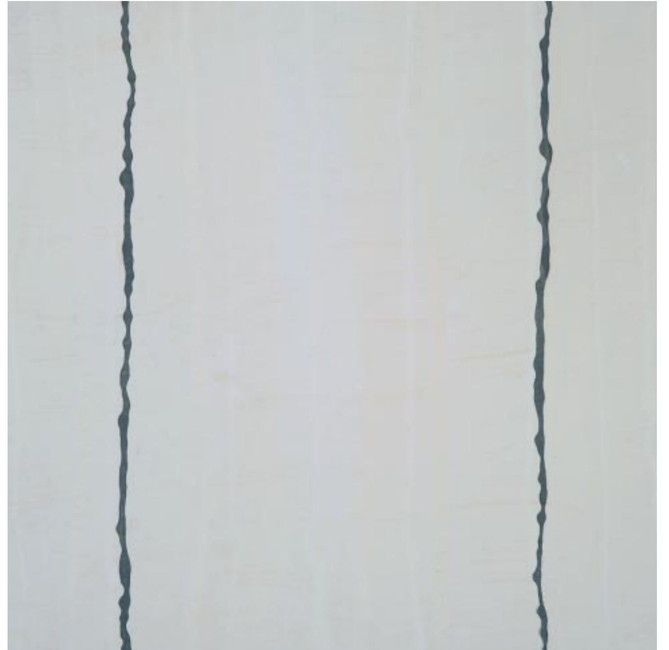
Uten tittel | Untitled ▶ Acryl og olje på lerret | Acrylic and oil on canvas 160 x 160 cm