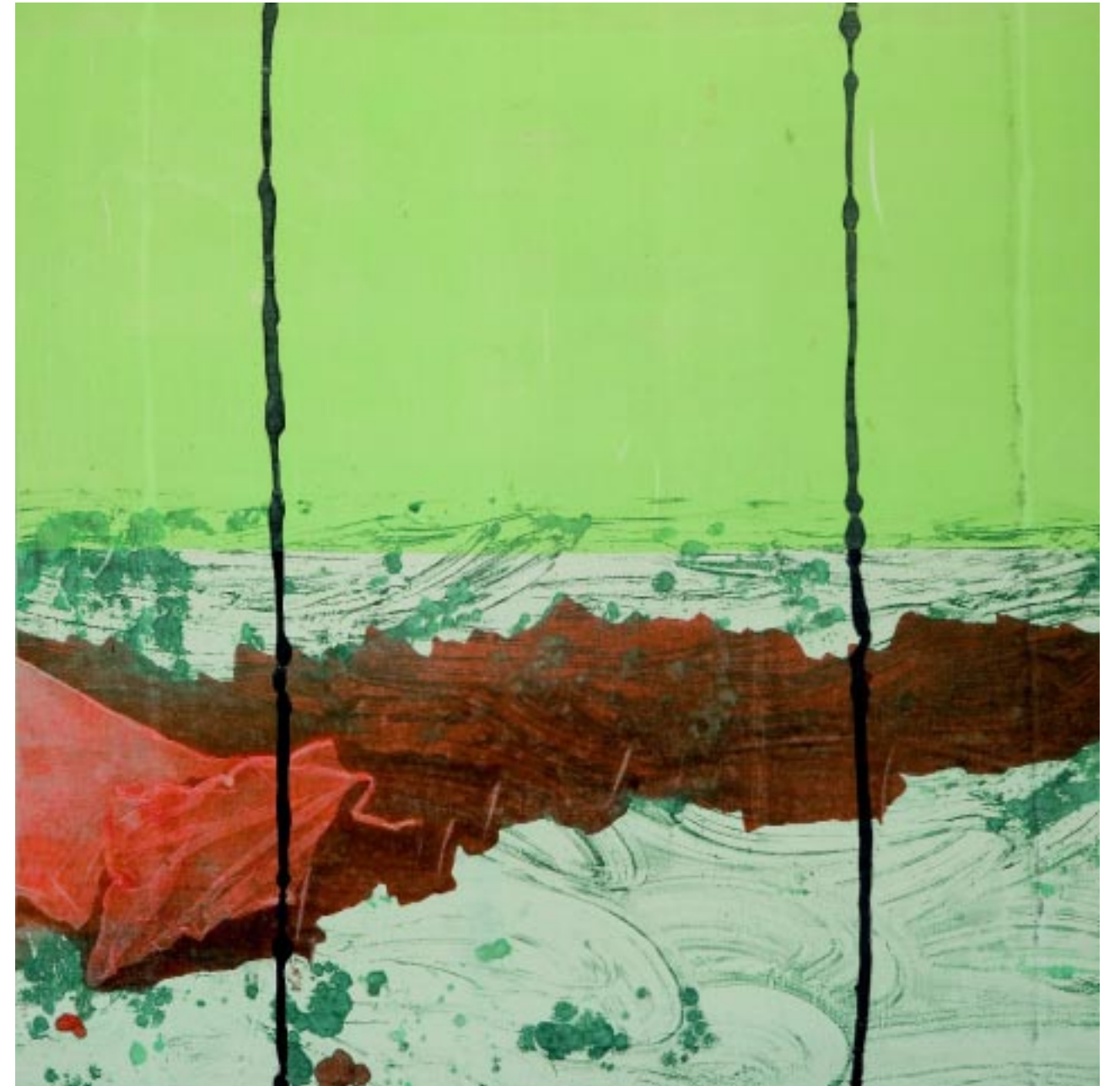
Uten tittel | Untitled > Acryl og olje på lerret | Acrylic and oil on canvas 160 x 160 cm