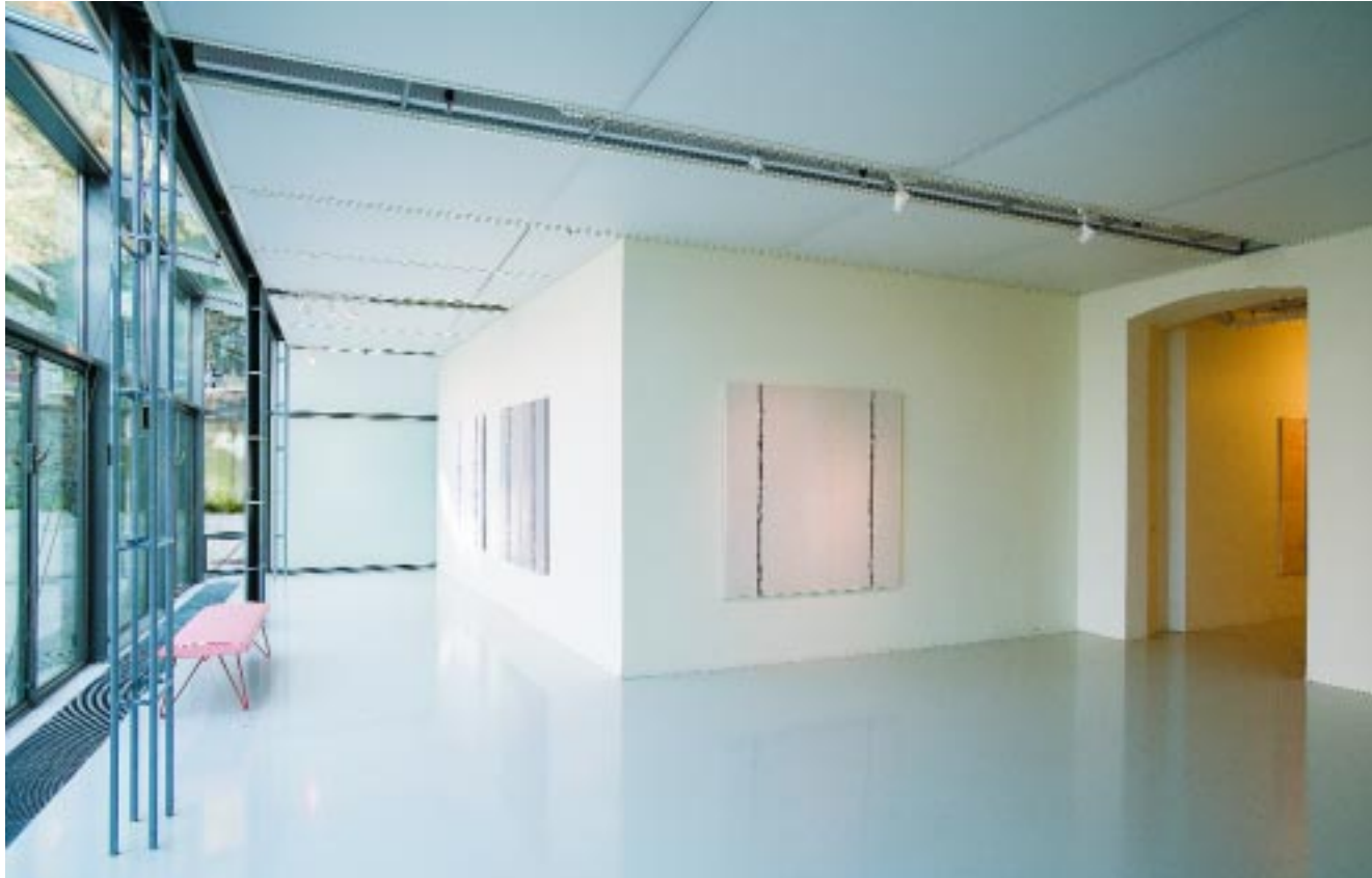
Visningsrommet, USF, Bergen, Feb 2006 | Exhibition room, USF, Bergen, Feb 2006